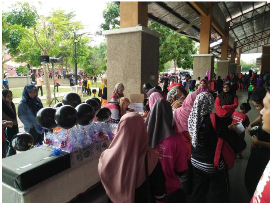
Sesi pendaftaran Hari Sukan Negara