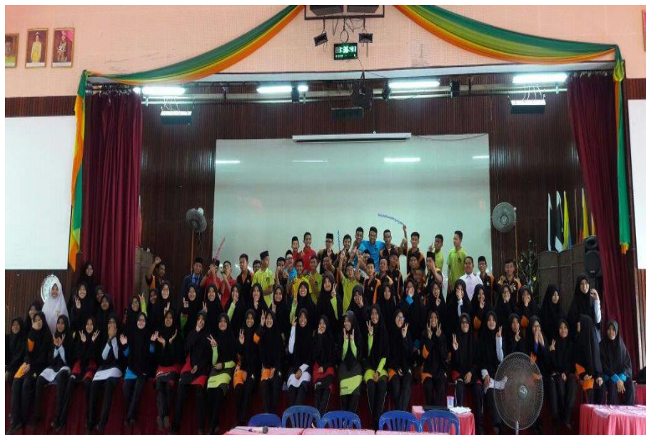
Sesi bergambar dengan pelajar selepas program (SMKA KUALA ABANG)