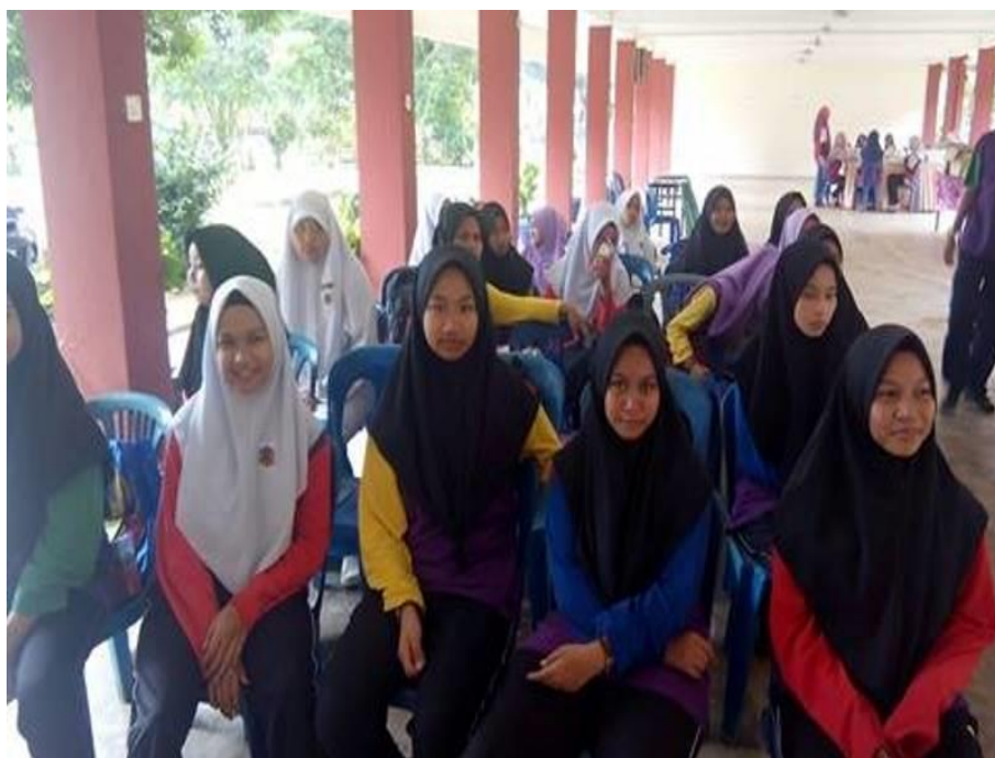
Sesi Penerangan Program dimulai dgn Taklimat Dashboard (My School), E-waste dan Penerangan Klik Dengan Bijak (SMK SERI RASAU)