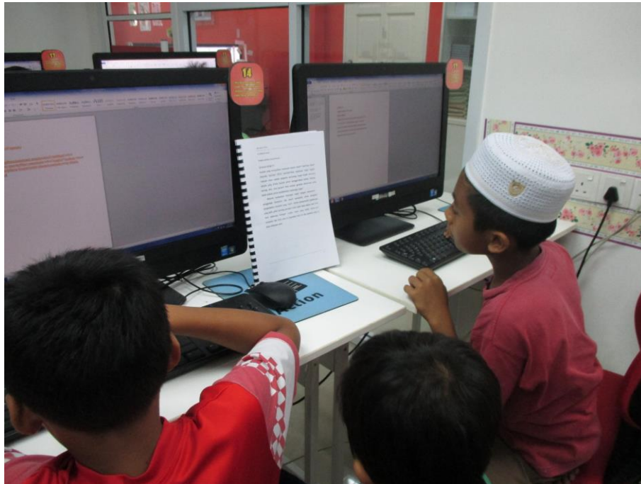
Peserta mengikuti kelas ILES