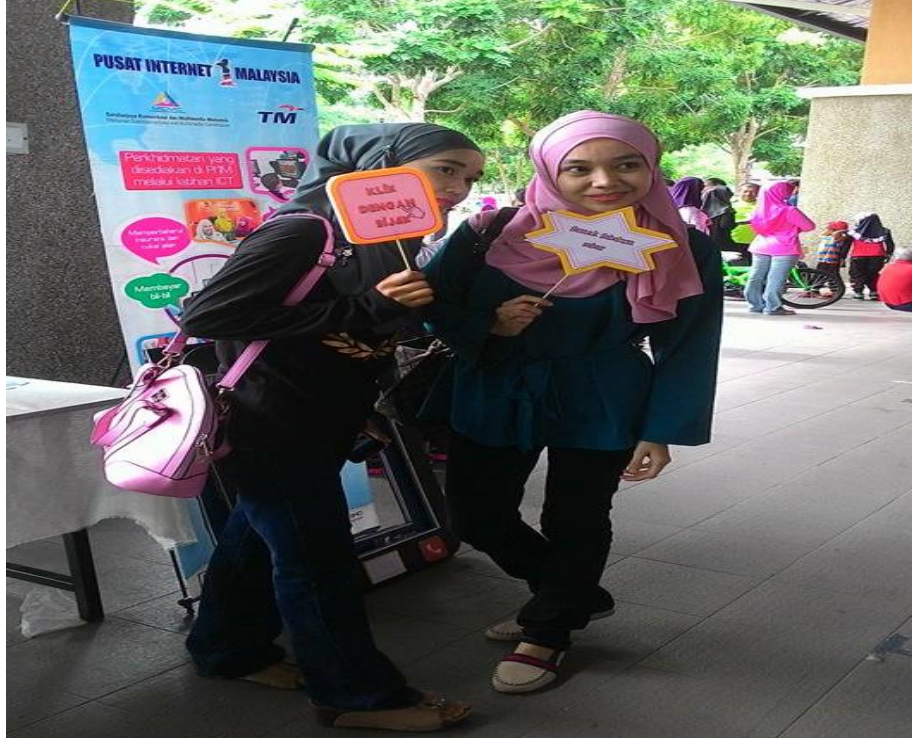
Peserta selfie kreatif & klik dengan bijak Hari Sukan Negara