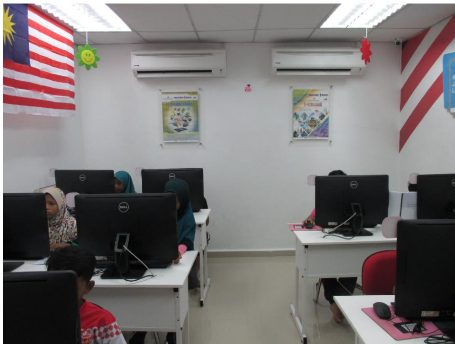
Peserta sedang mengikuti kelas