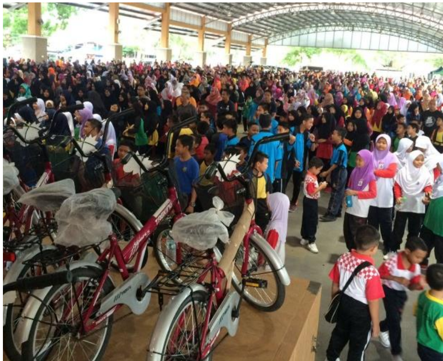
Sesi penyampai hadiah kepada pemenang Hari Sukan Negara