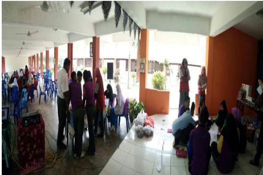
Program Mentor Mentee Klik Dengan Bijak