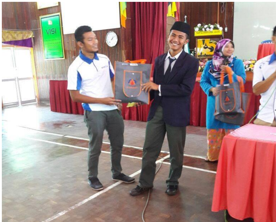
Sesi Penyampaian Hadiah kepada para pemenang