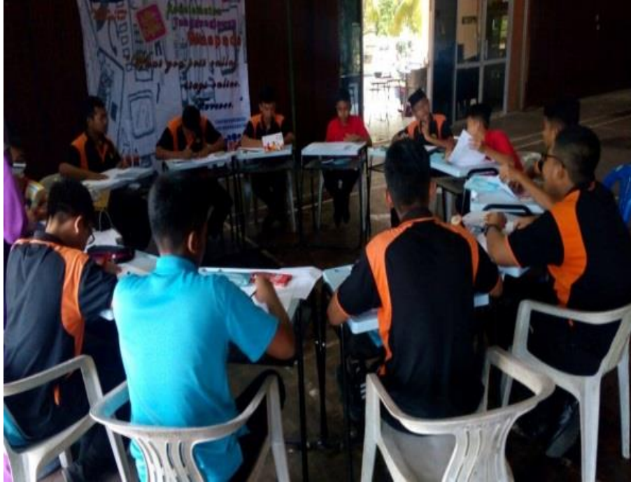
Program membuat poster klik dengan bijak