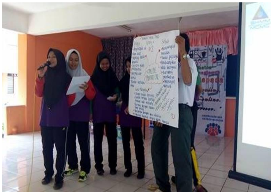
Sesi pembentangan Jenayah Siber